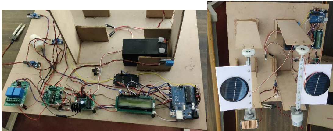
Fig. 2 Model Representation

turn powered the water pump. This ensured timely irrigation without human intervention, thereby optimizing water usage and avoiding overwatering. Once the soil reached the ideal moisture level, the pump was turned off automatically, demonstrating the effectiveness of the threshold-based logic.